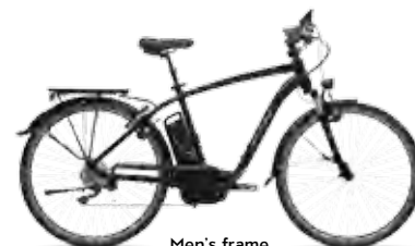
Men's frame pearl black