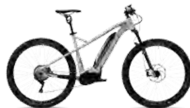
Uproc2 4.10 marble grey/aquamarine blue