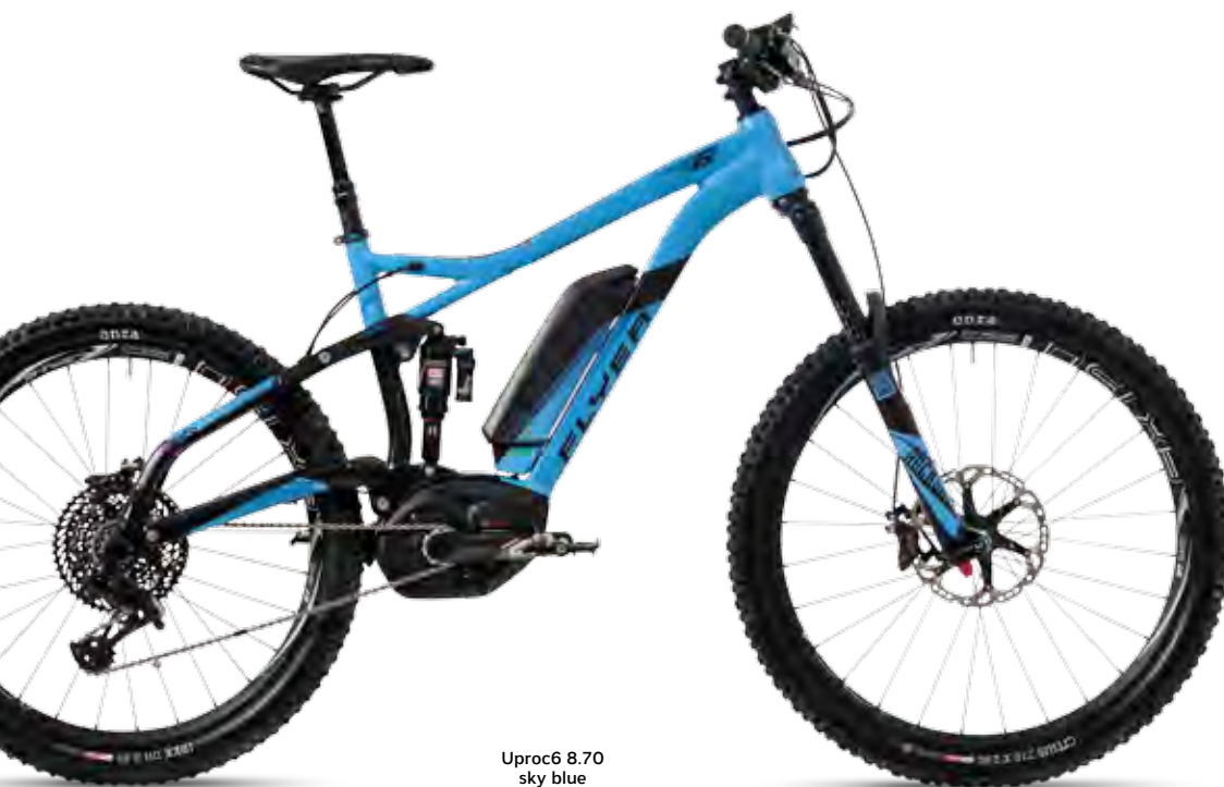
Uproc6 8.70 sky blue