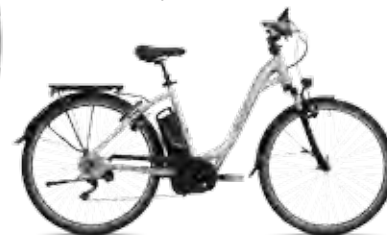
Low step-through frame silver (brushed aluminium)