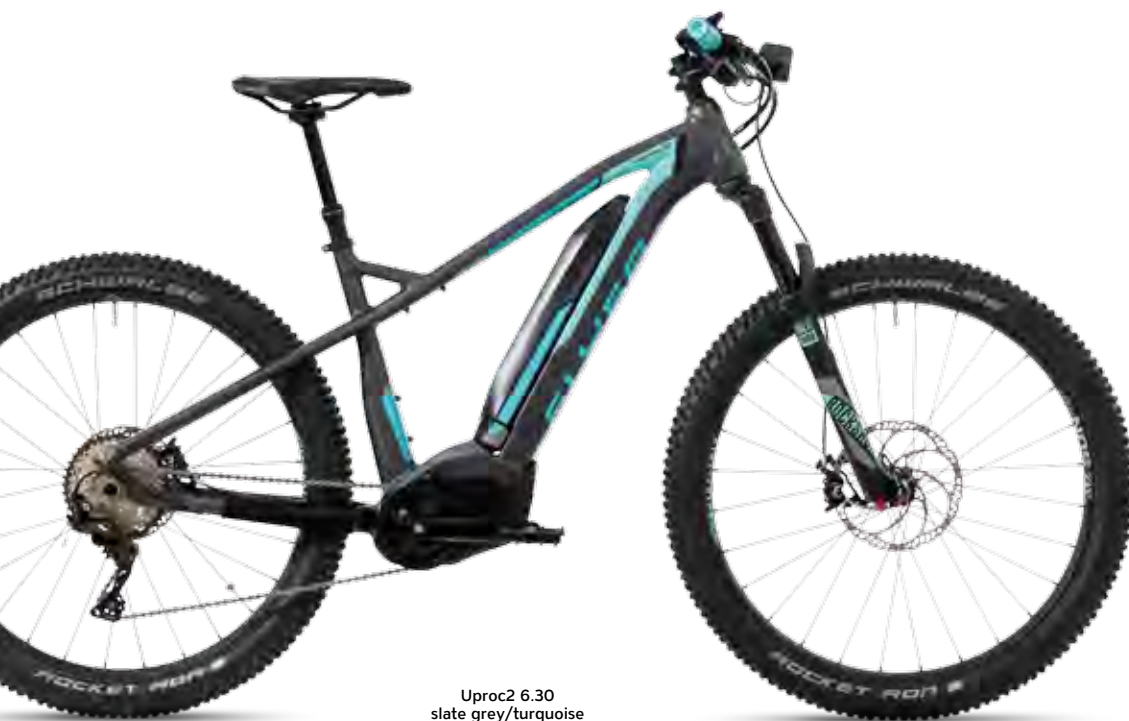
Uproc2 6.30 slate grey/turquoise