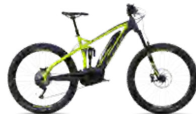
Uproc7 6.30 slate grey/lime green