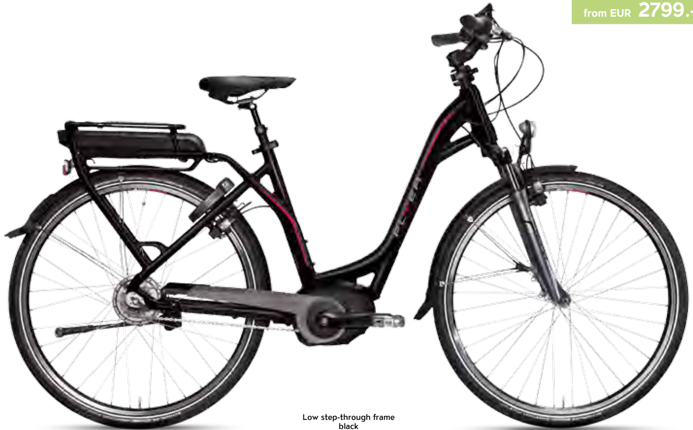
Low step-through frame black