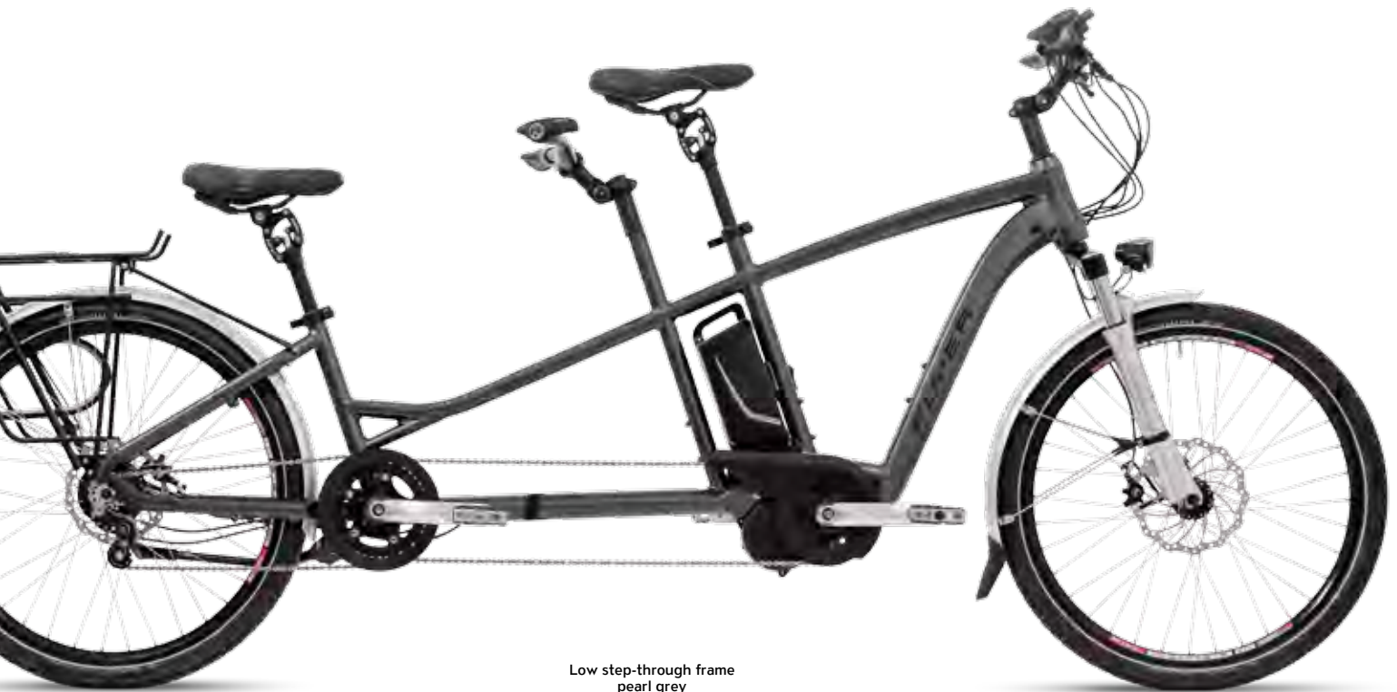
Low step-through frame pearl grey