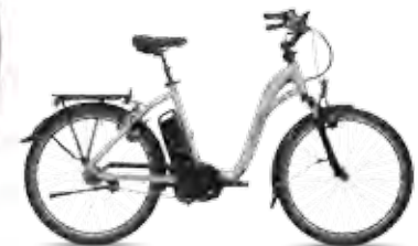
Low step-through frame silver (brushed aluminium)