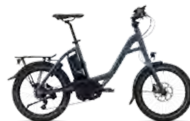
Low step-through frame midnight blue