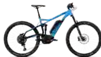
Uproc3 8.70 sky blue