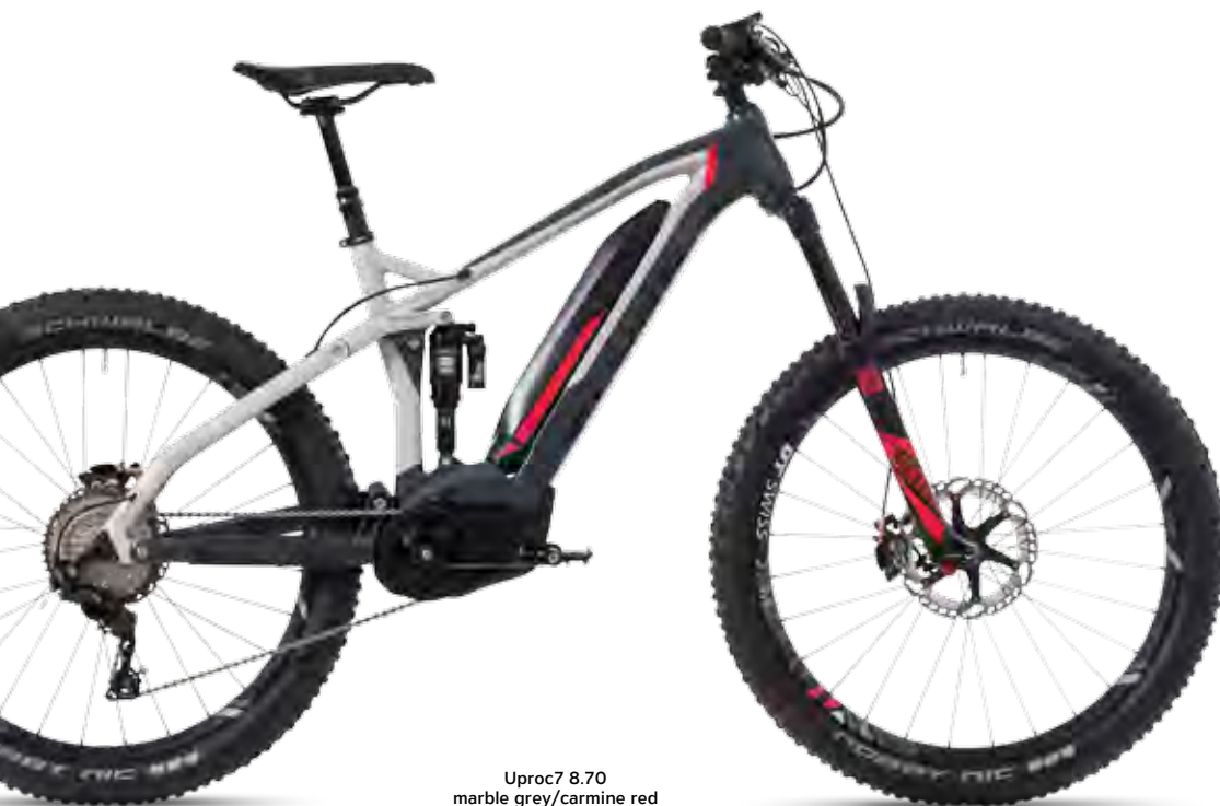
Uproc7 8.70 marble grey/carmine red