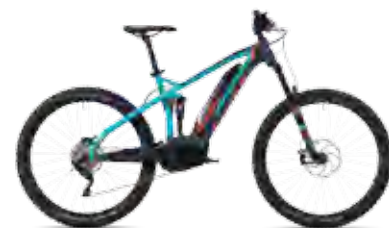
Uproc7 4.10 slate grey/sky blue