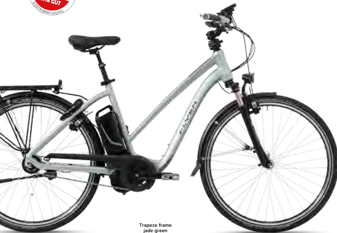
Trapeze frame jade green