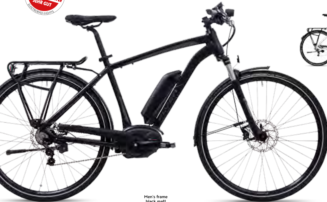
Men's frame black matt