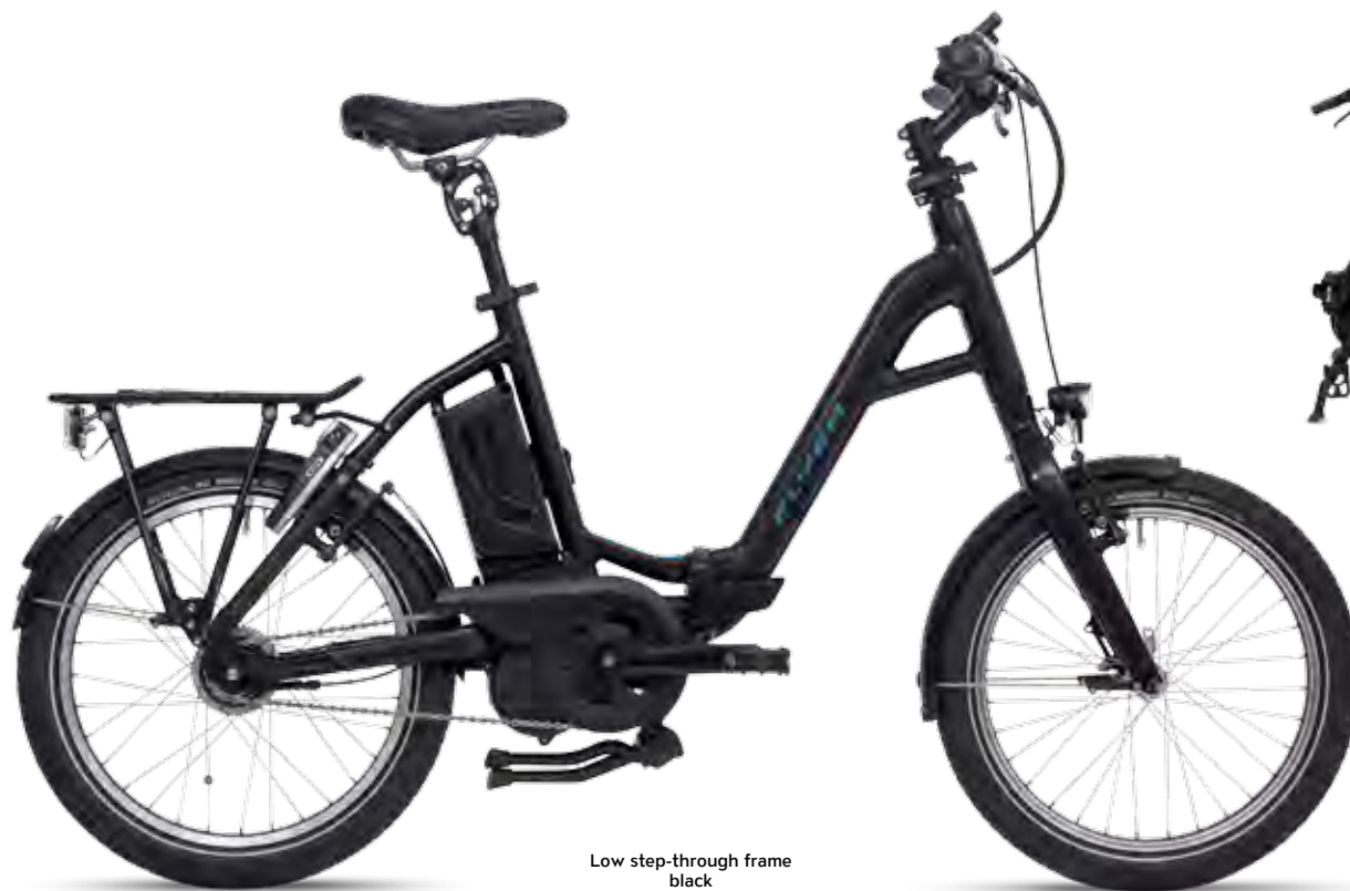
Low step-through frame black