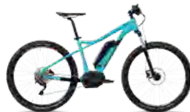
Uproc1 4.10 reef blue