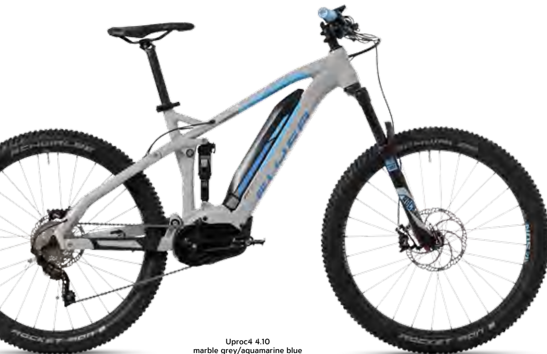
Uproc4 4.10 marble grey/aquamarine blue