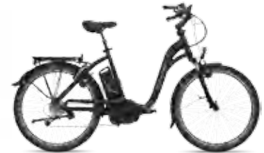
Low step-through frame pearl black