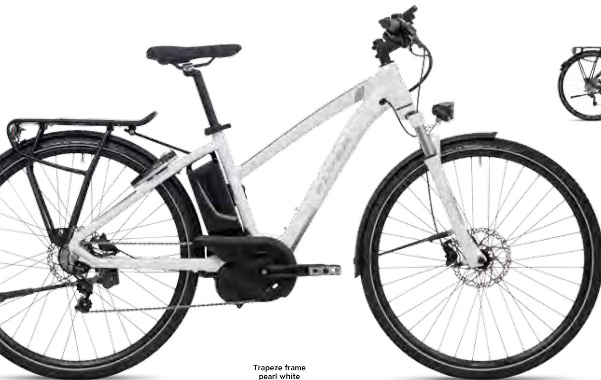
Trapeze frame pearl white