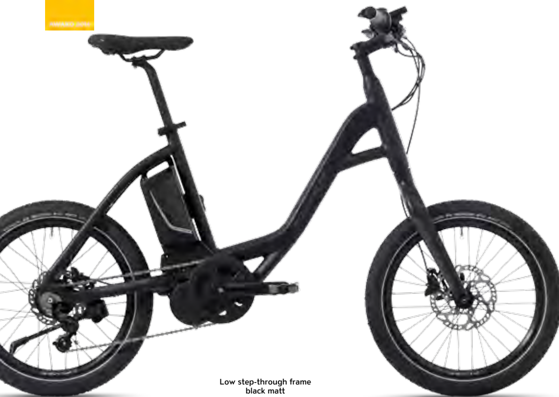
Low step-through frame black matt