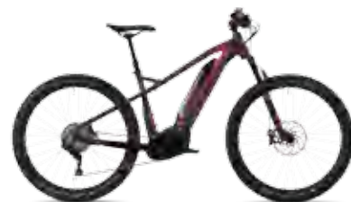
Uproc2 8.70 slate grey/swiss red