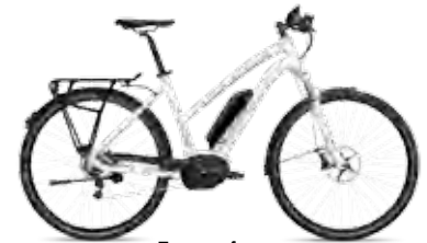
Trapeze frame pearl white