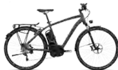
Men's frame pearl grey