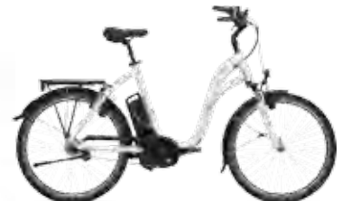
Low step-through frame pearl white