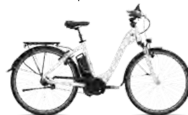
Low step-through frame pearl white