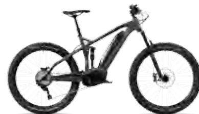
Uproc4 6.30 graphite grey/black