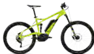
Uproc6 4.10 lime yellow