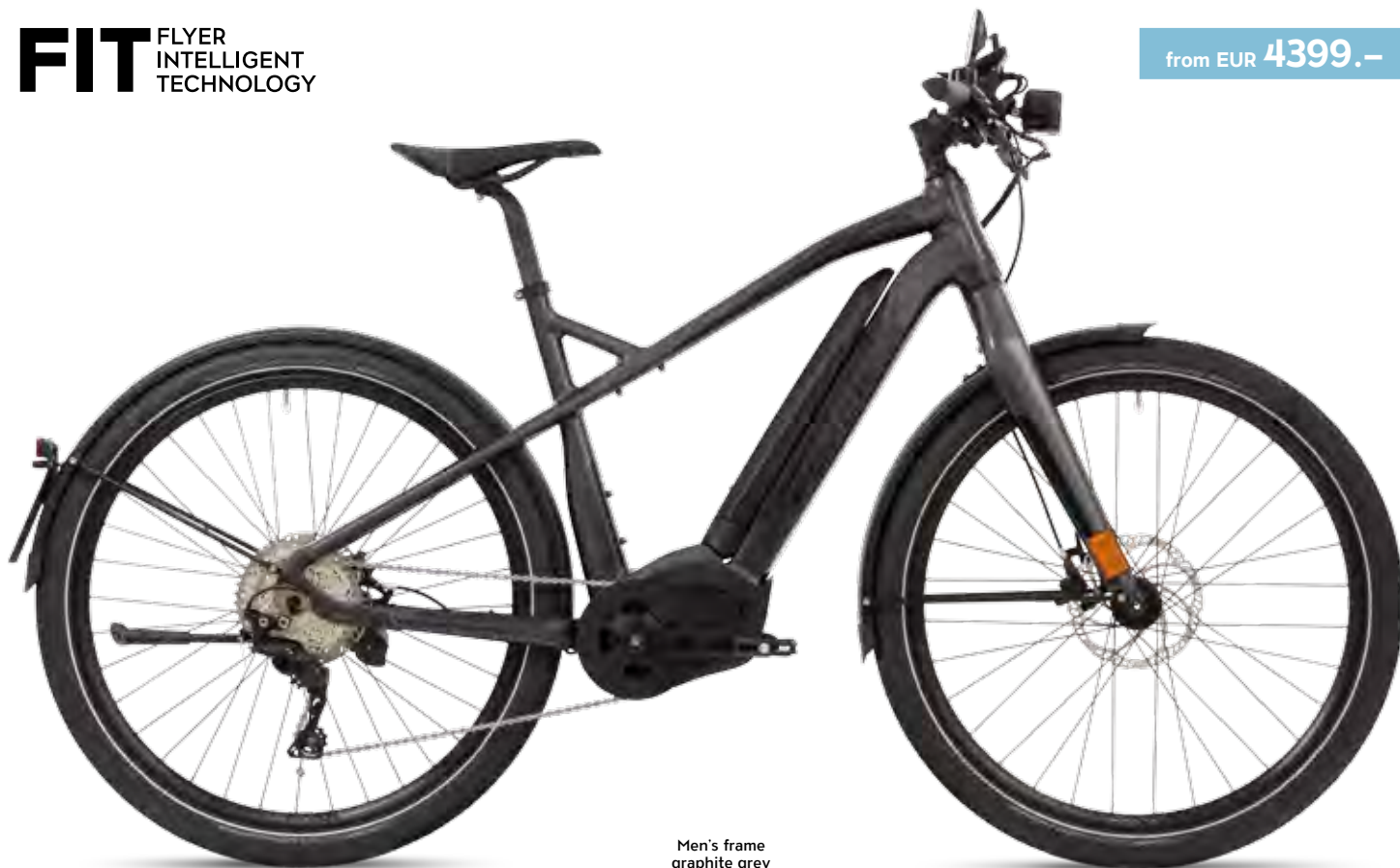
Men's frame graphite grey