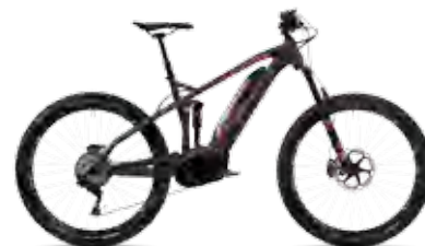
Uproc4 8.70 slate grey/swiss red