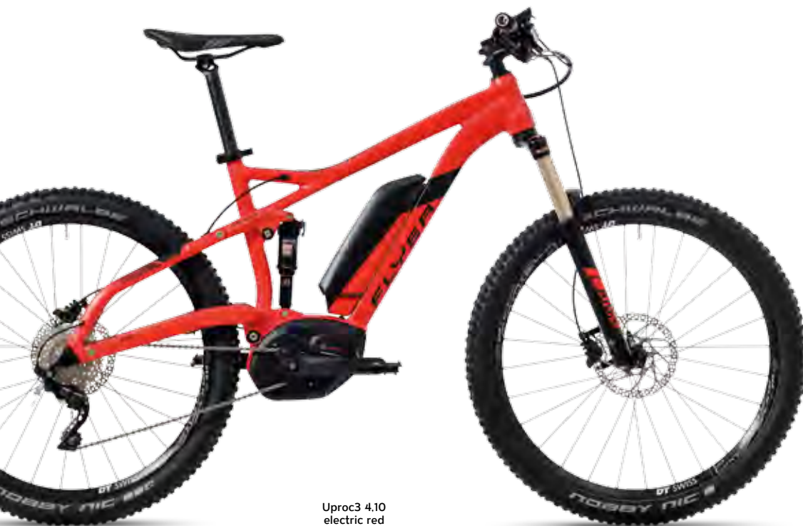
Uproc3 4.10 electric red