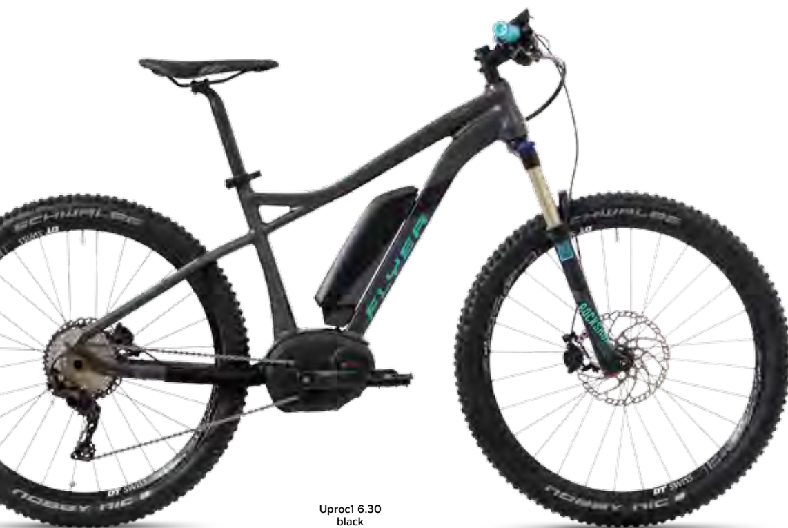
Uproc1 6.30 black