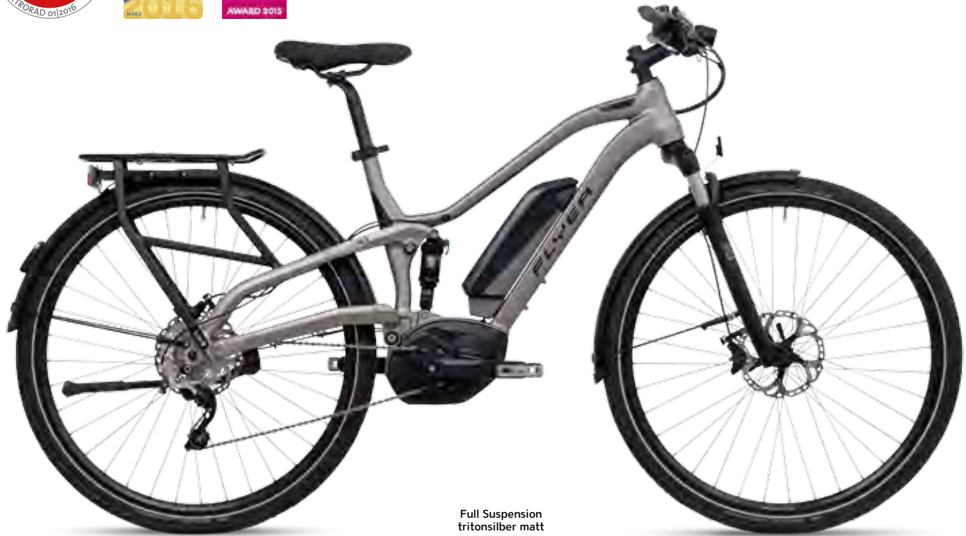
Full Suspension tritonsilber matt