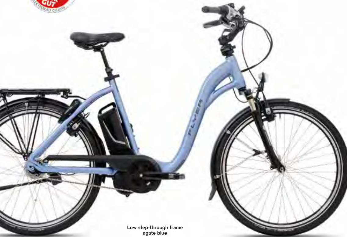
Low step-through frame agate blue